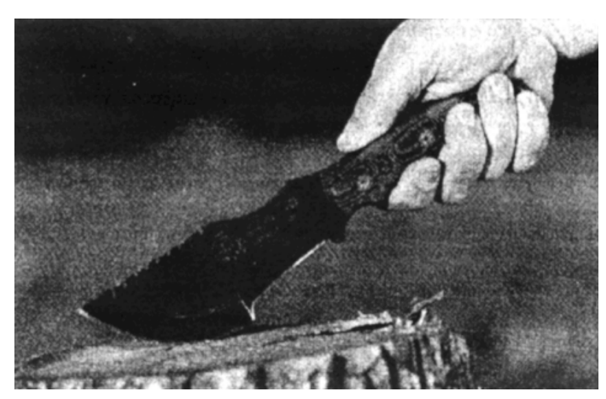
Hand position 2

To increase striking power even more, change hand to position three. This increases leverage for heavier chopping, but may not be as comfortable for extended periods of chopping as position two.