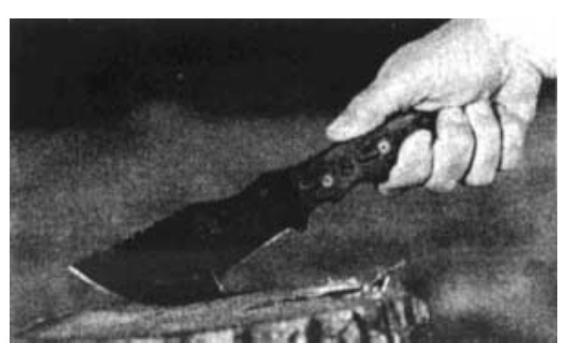
Hand position 3

To increase striking power even more, change hand to position three. This increases leverage for heavier chopping, but may not be as comfortable for extended periods of chopping as position two.