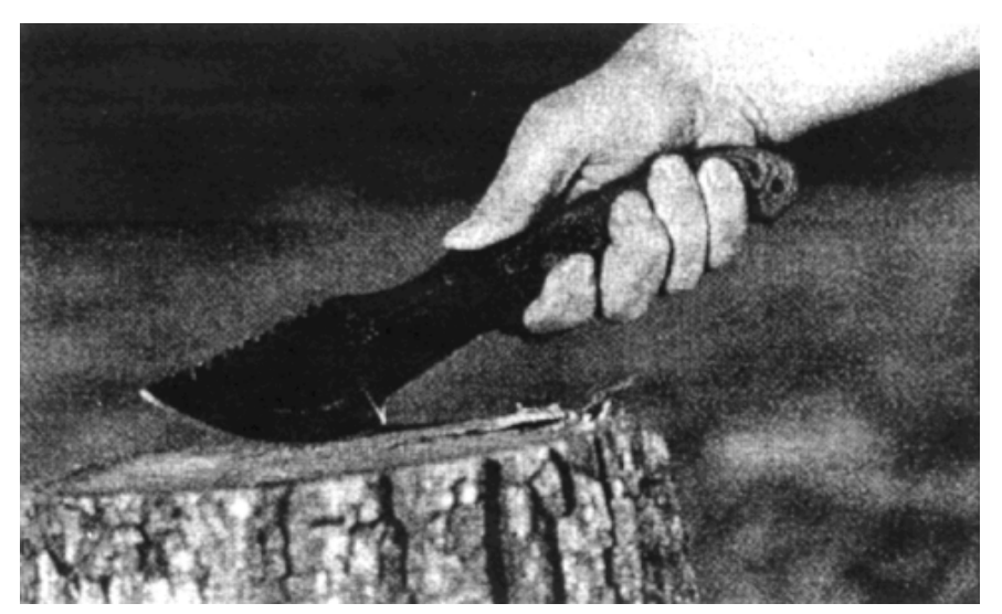
Hand position 1

The key to effective chopping is leverage. The Tracker Knife has a three position handle that allows the user to vary the amount of leverage on the axe. With the hand in position one, the user can do light chopping chores.