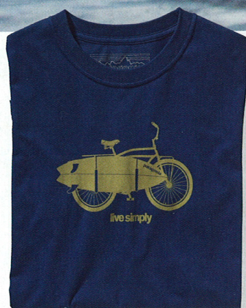
live simply™ surf bike t-shirt