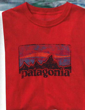
vintage '73 logo t-shirt

59752 | $35.00 | XS-XXL | 190 g (6.7 oz)