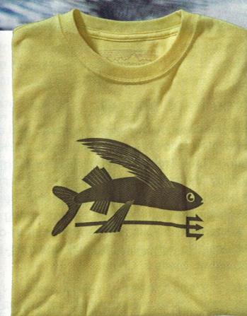
flying fish t-shirt

RDS-791 FEA-950 VGO-971 MORE COLORS AVAILABLE ONLINE