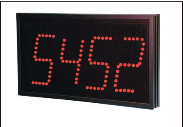
Microframe® Model 940 Display

The 920, 930, and 940 Remote Displays are designed to operate with the Model 904 Keypad or Model 6200 Timer Keypad. The Remote Display receives power and signal from a single cable connected to the Keypad and is turned on or off with the Keypad power switch.