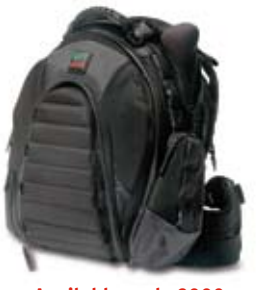
Available early 2009