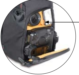
Arrange dividers vertically for quick access to extra equipment.