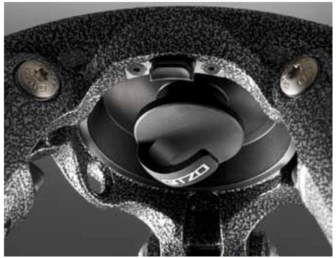
Even if the top casting is left open by accident, the centre component is held securely in place by the secondary safety mechanism until the button is pushed, protecting expensive camera equipment.