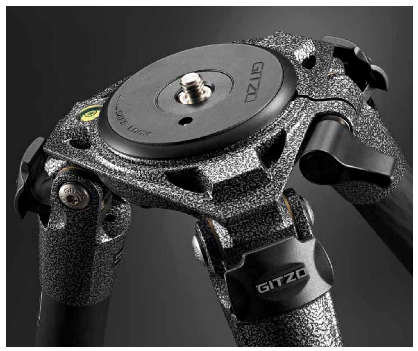
Systematic's top casting opens to allow specialised centre components to be interchanged. A ratchet locking lever is now used to close and open the top casting quickly and easily.

Systematic - the pinnacle of Gitzo technology, craftsmanship and