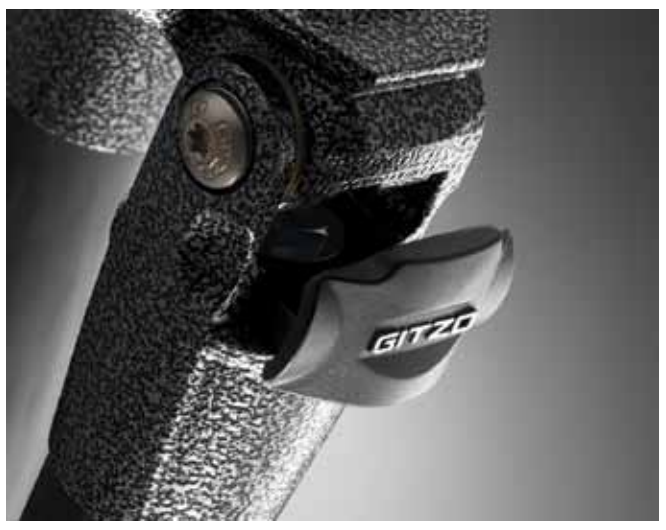
New leg angle selectors offer more grip room to make tripod setup and adjustment easier.