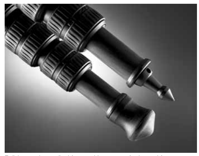
Built-in one-piece spiked feet provide a secure footing and fast set-up on all surfaces. The spikes have a resistant anti-scratch finish that protects delicate floors, but protective rubber caps are fitted for everyday usage.