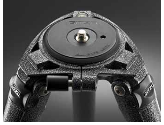
The geometry of the top casting improves stability and distributes weight more evenly; combined with a high-performance bonding and assembly process, it gives Systematic its outstanding strength under heavy loads.