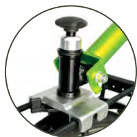
Patented Burley Hitch