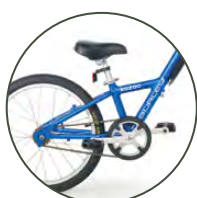
The Kazoo is a one-speed version of the Piccolo.