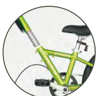
Tow bar removes for storage and transport.