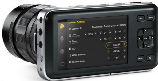
Blackmagic Pocket Cinema Camera Features an active MFT lens mount and high resolution 3.5" LCD.

resolution ProRes 422 (HQ) files direct to fast SD cards, so you can immediately edit or color correct your media on your laptop. Blackmagic Pocket Cinema Camera is everything you need to bring cinematic film look shooting to the most difficult and remote locations, perfect for documentaries, independent films, photo journalism, music festivals, ENG, protest marches and even war zones.