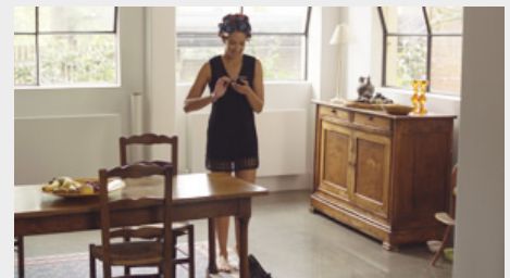
Final Color Graded Shot