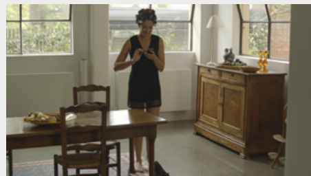
RAW Wide Dynamic Range